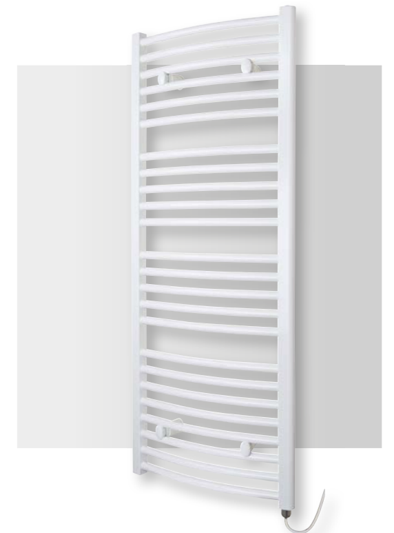
ELECTRIC AVONMORE CURVED

For more general information, please see page 264.