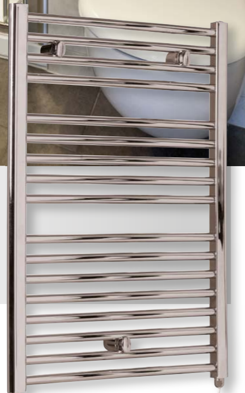
ELECTRIC AVONMORE STRAIGHT

The electric model of our most popular towel warmer, AVONMORE, combines all the benefits of the hydronic range, with the advantages of electric heating. It is a classic multi-rail design that is available in a range of sizes, finishes and straight or curved models. This makes it an extremely popular specification product for new build. It has three rail configurations and tube spacing for practical towel placement and is a flexible choice for any project.